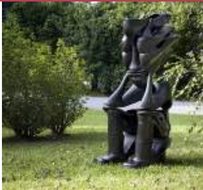
Willie Cole, The Sole Sitter , 2013. Bronze. Collection of the McNay Art Museum, Museum Purchase with funds from the Russell Hill Rogers Fund for the Arts. © Willie Cole

Register your school at: mcnayart.org/spotlight by Friday, March 20, 2021